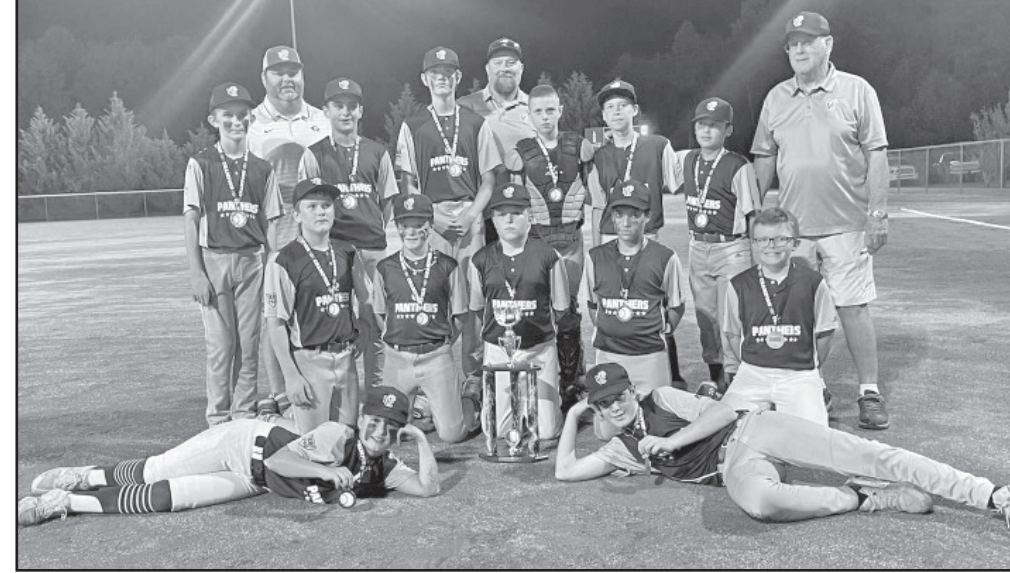
The Union County Rec Department's 12U District 7 champion baseball team.

The 10U softball team opened play on Monday vs. the winner of Lumpkin County and host White County. The title game is Tuesday at 7:30 p.m. with the 'if necessary' game set for 6 p.m. Wednesday.