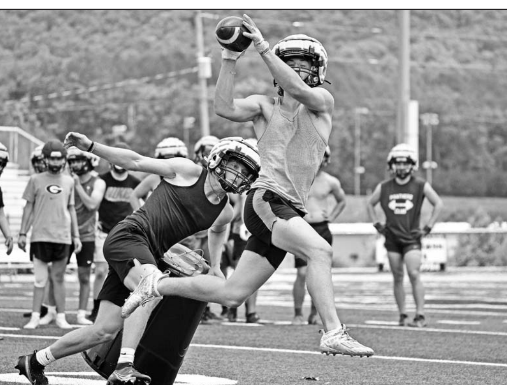
Union County football performs passing drills on Monday, June 6 -- the first day teams were allowed to begin

The Panthers will resume for the final 120 minutes. And and will wrap up Thursday with