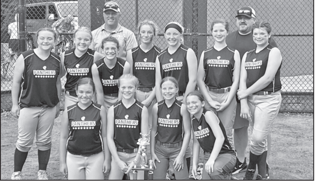
The Union County Rec Department's 12U District 7 champion softball team.

By Todd Forrest Sports Editor sports@nganews.com