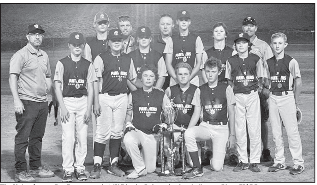
The Union County Rec Department's 14U District 7 champion baseball team.