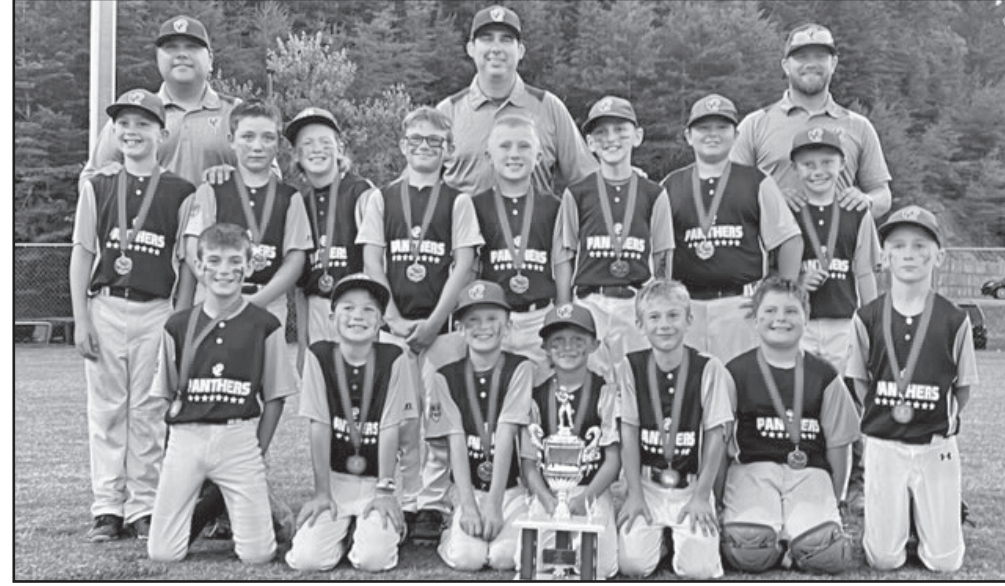
The Union County Rec Department's 10U District 7 runner-up baseball team.